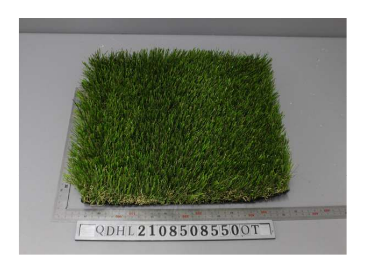
SGS authenticate the photo on original report only ***End of Report***