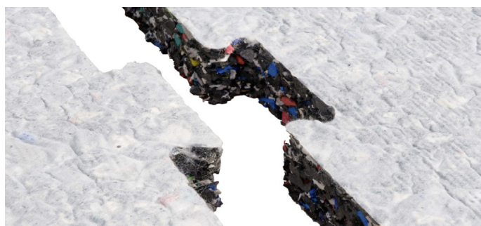
Puzzle shaped ProPlay® for Playgrounds fall protection pad